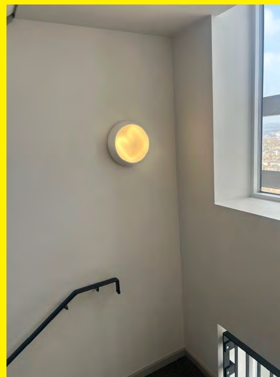
Emergency lighting in stairwell at 9A York Way.

The lighting should illuminate all escape routes, emergency exit/s and firefighting equipment.