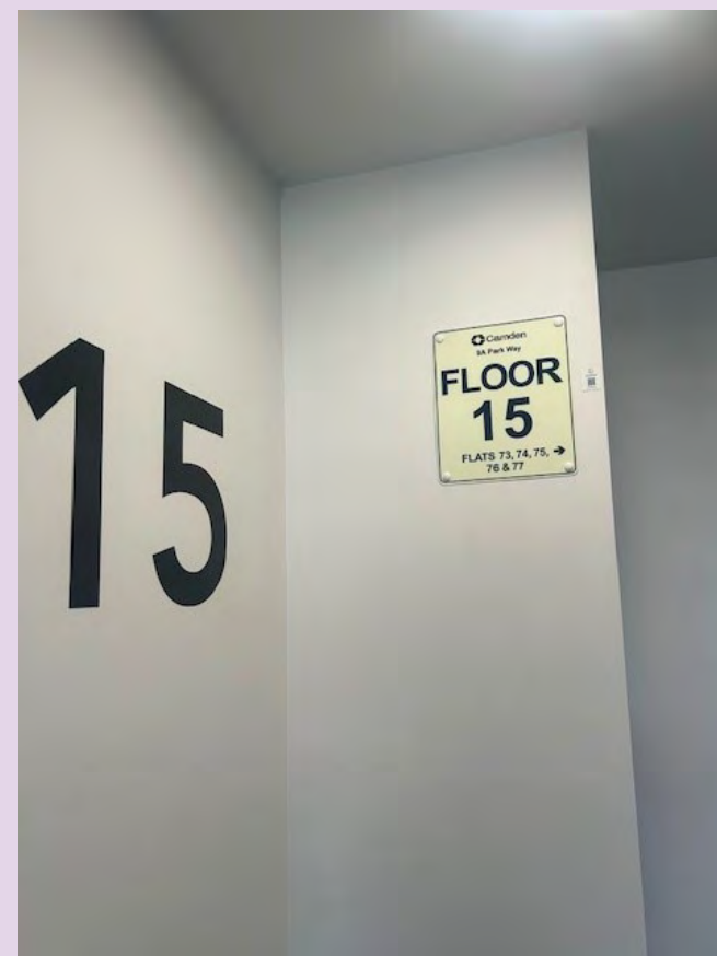
Various wayfinding signage at 9A York Way.

Wayfinding signage is a visual communication tool to assist the Fire and Rescue Service in locating specific flats as they navigate their way round a building.