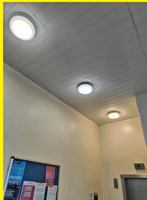
Emergency lighting at Riverfleet.

Emergency lighting provides illumination in instances where mains power may have failed. It illuminates escape routes, emergency exit/s and firefighting equipment. It will provide illumination to signage and provide sufficient lighting to help you to escape.