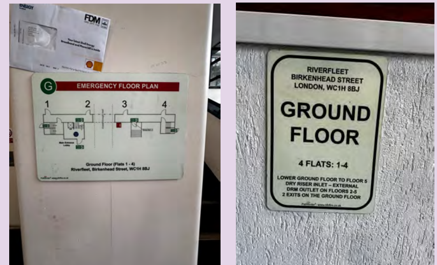
Various Wayfinding signage at Riverfleet.

Wayfinding signage is a visual communication tool to assist the Fire and Rescue Service in locating specific flats as they navigate their way round a building.