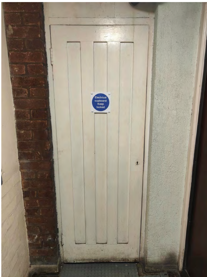
Electrical intake cupboard fire door at Riverfleet.

Doors to plant rooms, electrical intake and lift motor rooms (including fire rated hatches or panels)