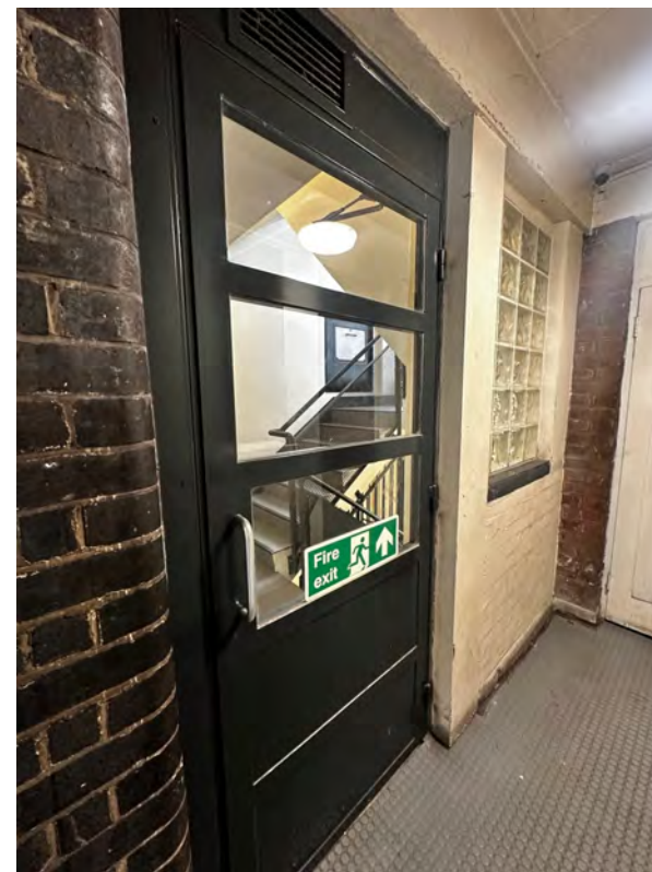
Communal Fire Door at Riverfleet.