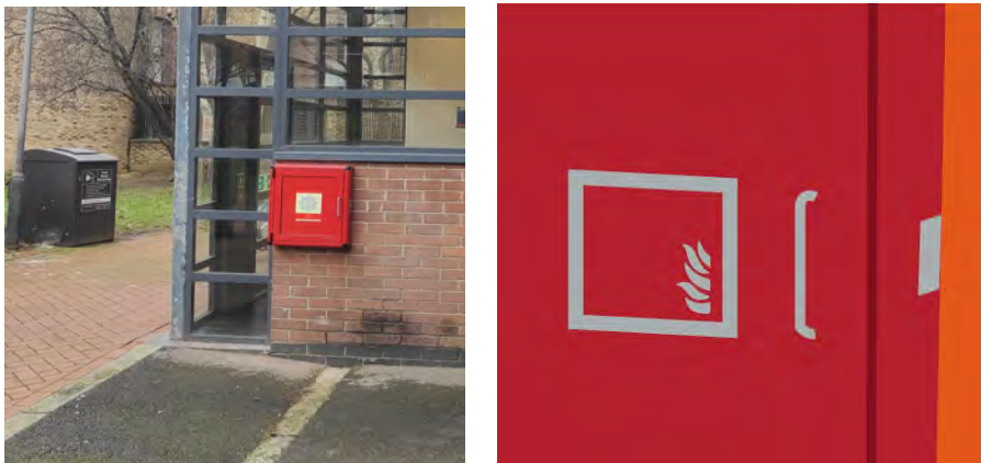
Secure Information Box at Riverfleet.

Secure Information Boxes are easily identifiable storage units for documents intended for use by the fire and rescue service during a fire.