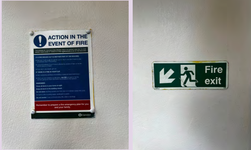
Fire Action Notice and Fire Exit Sign at Riverfleet.

We have installed Fire Action Notices and Fire Exit Signs in your building.